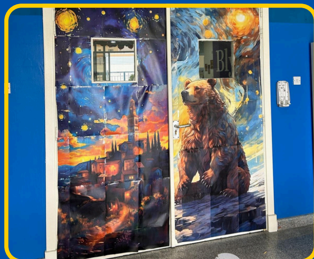
Re-design of the Bears Den

THANK YOU FOR CHOOSING BLYTH ACADEMY QATAR