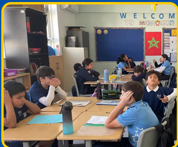
Grade 5 Brain Break exercises