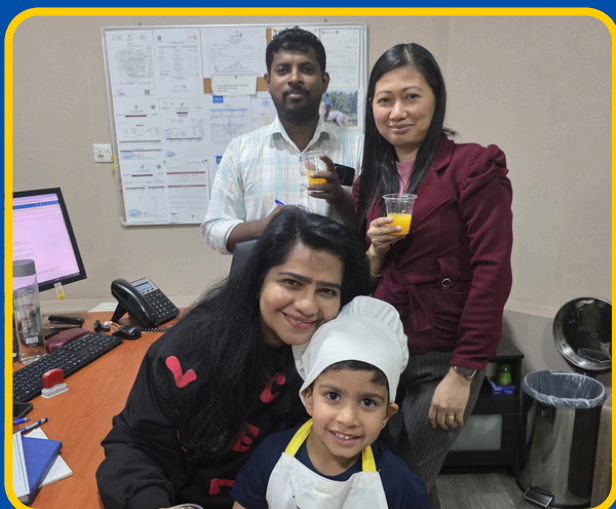
JK Juice making day