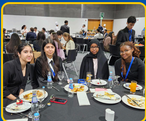
Students at M.U.N