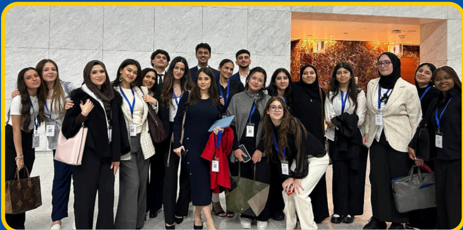
Students at MUN