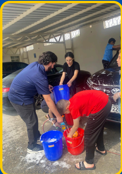
Grade 6 students participating