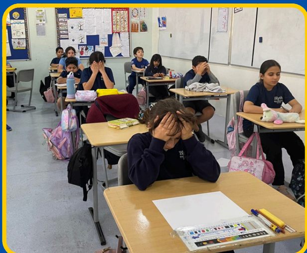
Grade 5 Brain Breaks Exercises