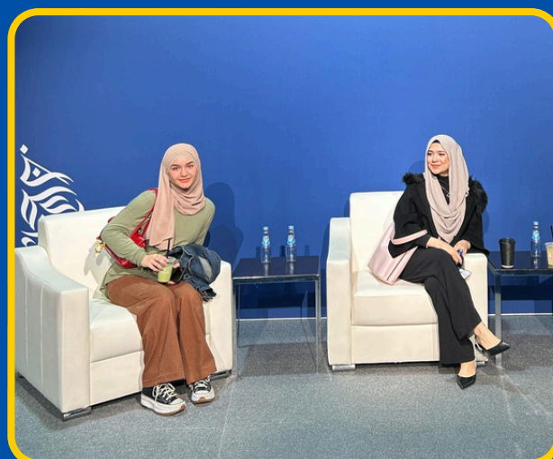
International day of Education Convention