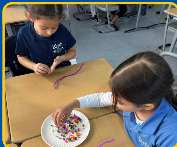
Grade 1 Bead making

THANK YOU FOR CHOOSING BLYTH ACADEMY QATAR