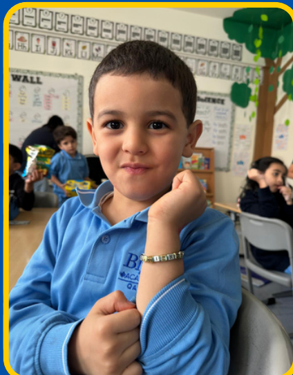
Grade 1 Students