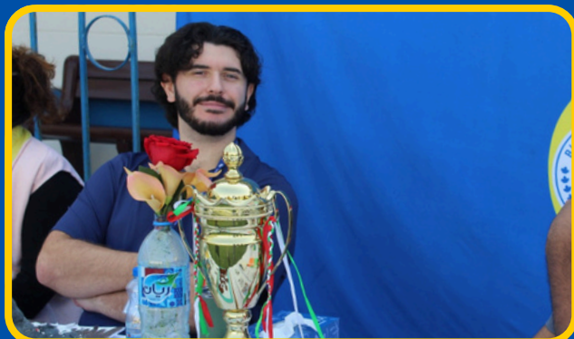
Staff at Open house 2025