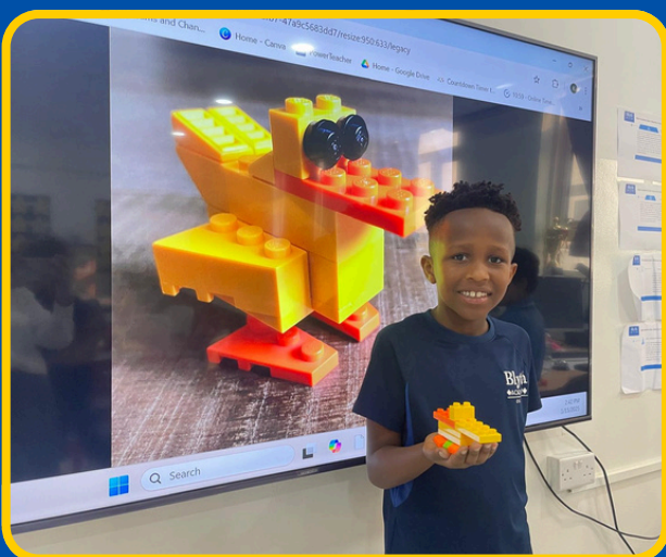
Students in lego club