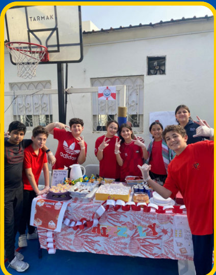
Students from Grizzly