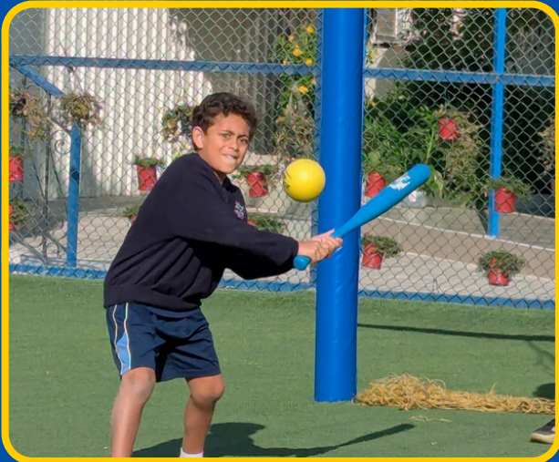
Students enjoying P.E