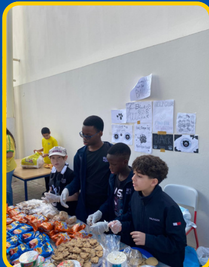
Students from Black Bear