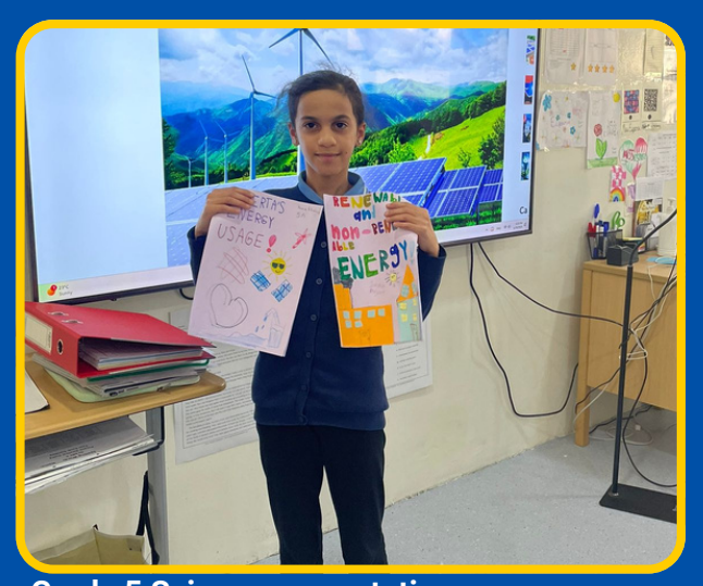
Grade 5 Science presentations