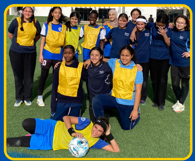
U/12 & 14 Football girls at ASD