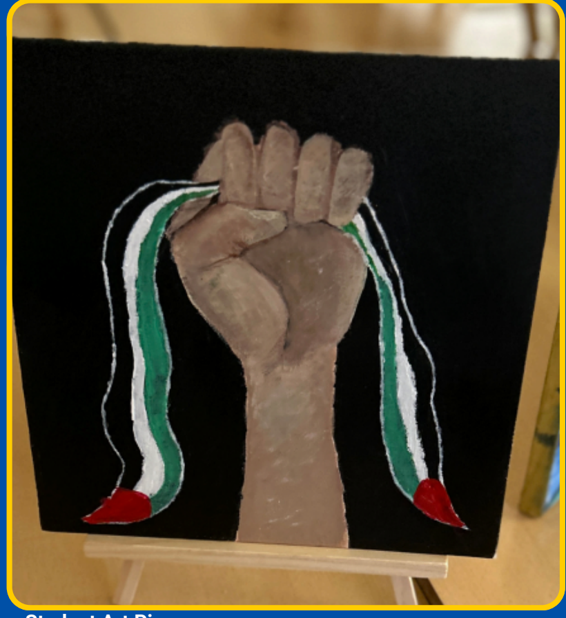
Student Art Pieces